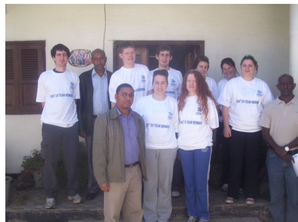
GV team from Republic of Ireland with HFHE staff at HFHE National Office (December 28, 2011)

HFH Ethiopia has served more than 7000 families with its housing, kitchen improvement, and water and sanitation programs since 1993 and remains committed to continue serving more families at an increasing rate in the years to come.